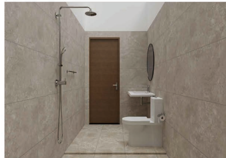
PERSPECTIVE VIEW 02