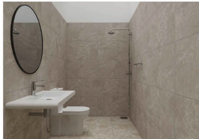
PERSPECTIVE VIEW 01