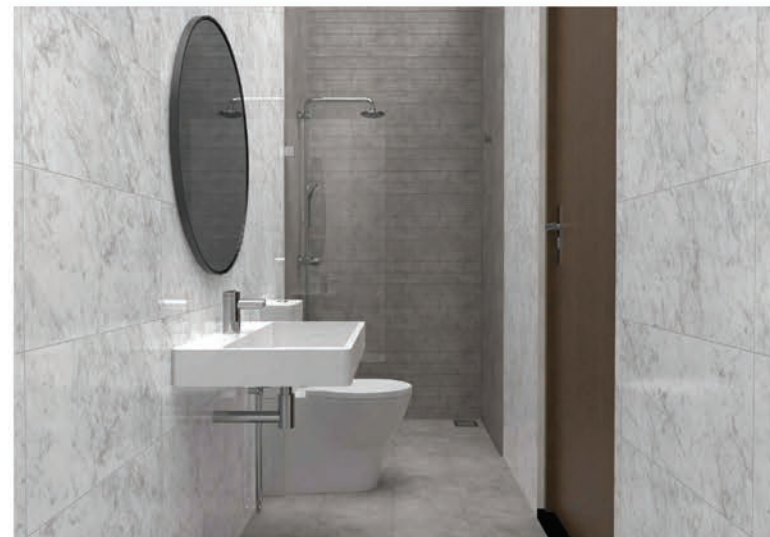
PERSPECTIVE VIEW 02