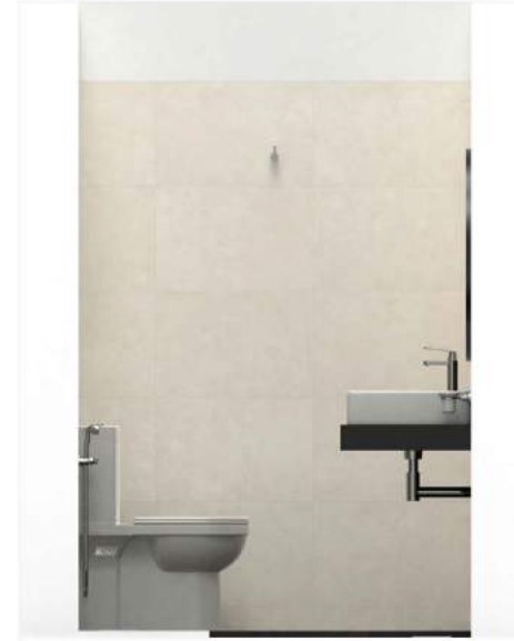
ELEVATION - D