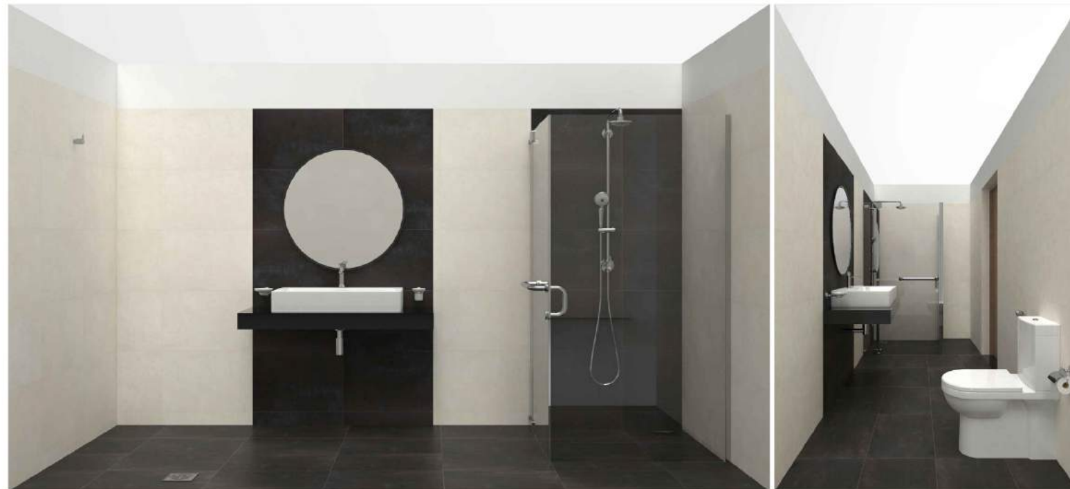
PERSPECTIVE VIEW 01