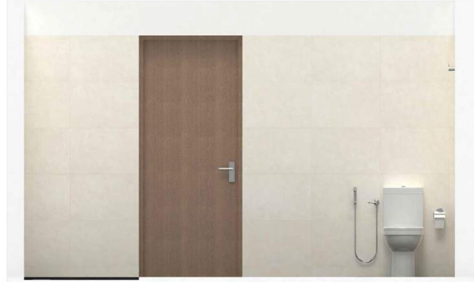
ELEVATION - C