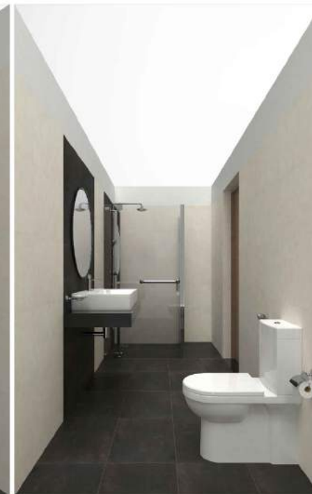
PERSPECTIVE VIEW 02