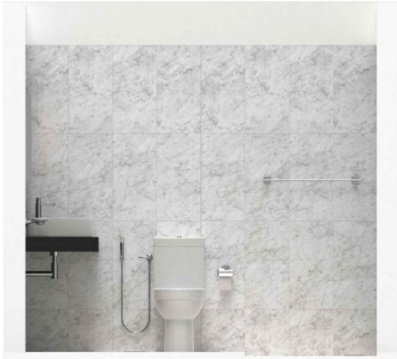
ELEVATION - A