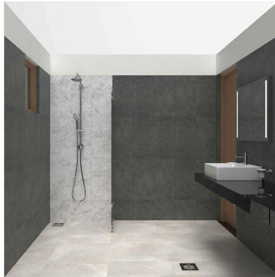
PERSPECTIVE VIEW 01