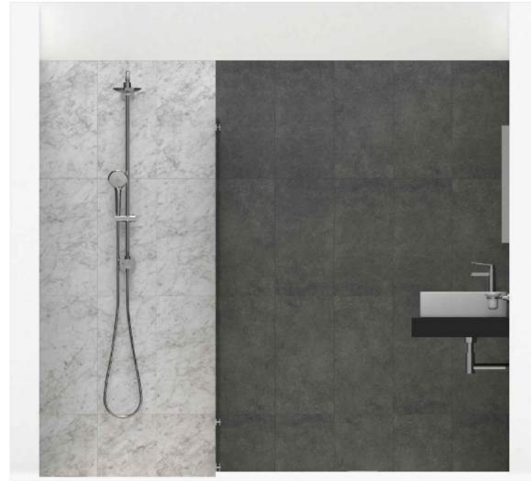
ELEVATION - C