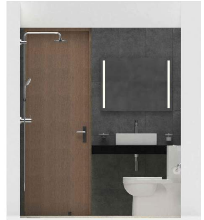
ELEVATION - D