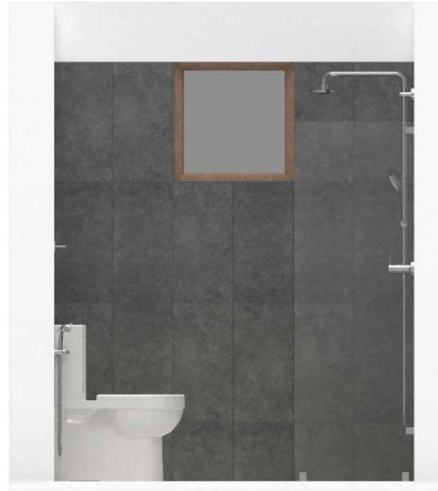
ELEVATION - B