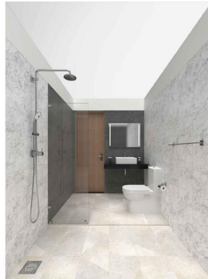
PERSPECTIVE VIEW 02