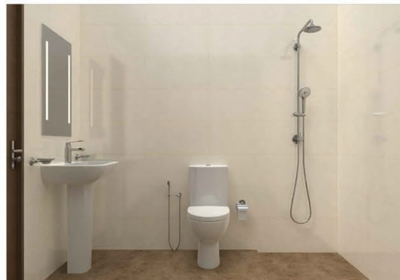
PERSPECTIVE VIEW 01