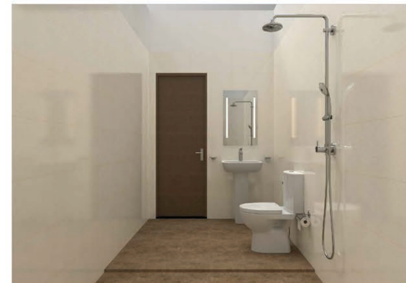
PERSPECTIVE VIEW 02