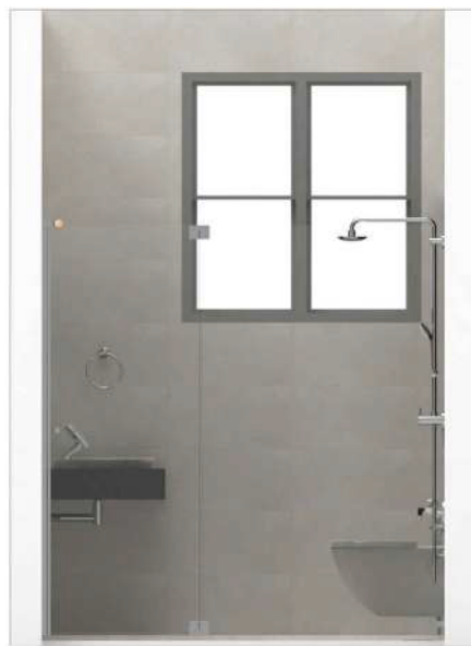
ELEVATION - B