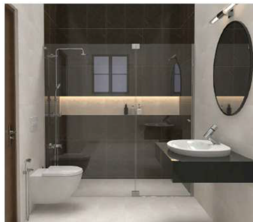
PERSPECTIVE VIEW 01