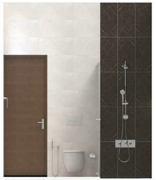
ELEVATION - C