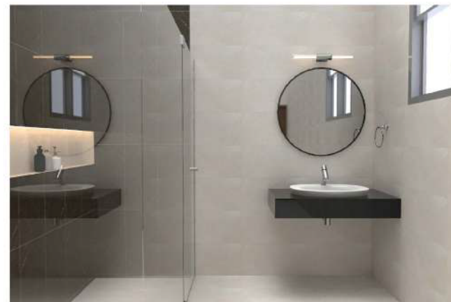
PERSPECTIVE VIEW 02