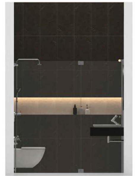
ELEVATION - D