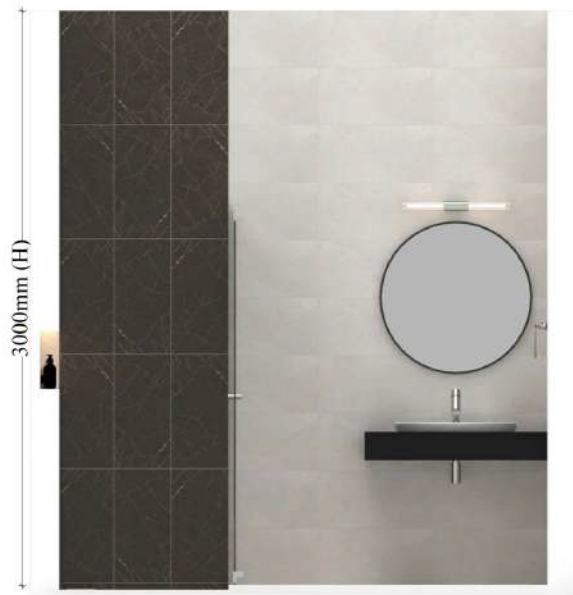
ELEVATION - A