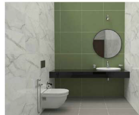
PERSPECTIVE VIEW 01