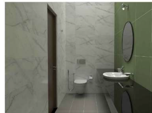
PERSPECTIVE VIEW 02