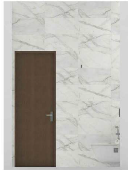
ELEVATION - C