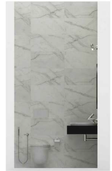
ELEVATION - D