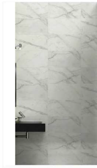
ELEVATION - B