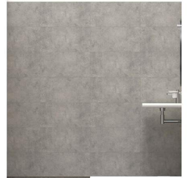
ELEVATION - D