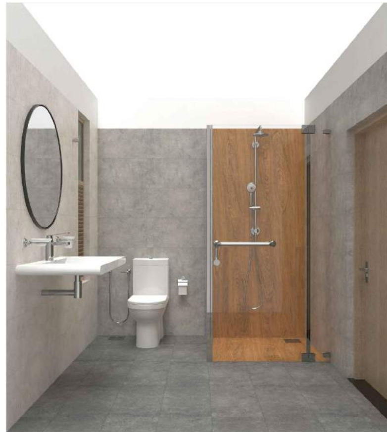
PERSPECTIVE VIEW 02