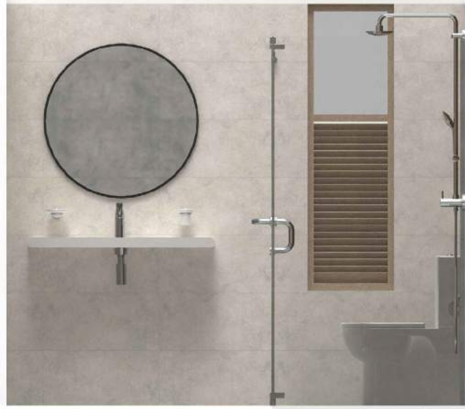
ELEVATION - A