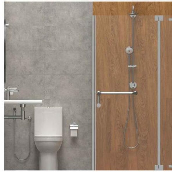
ELEVATION - B