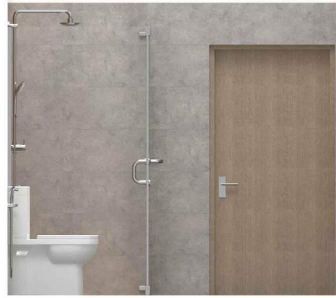
ELEVATION - C