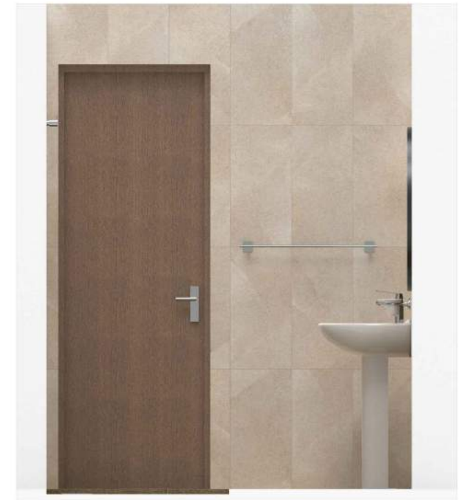
ELEVATION - D