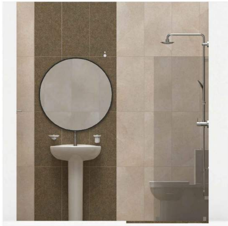
ELEVATION - A