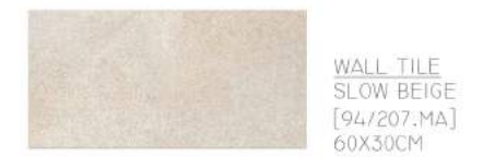
WALL TILE SLOW BEIGE [94/207.MA] 60X30CM