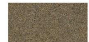
FLOOR & WALL FEATURE TILE AMBERES BROWN [K4/432.MA] 60X30CM