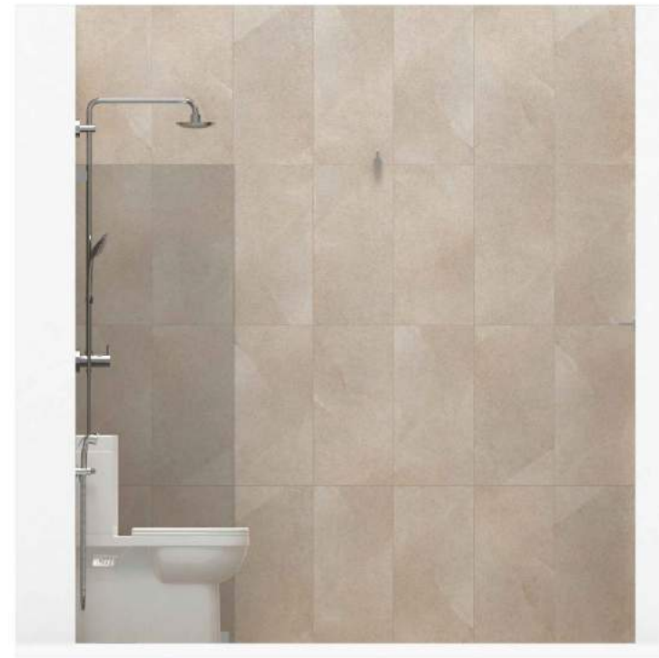
ELEVATION - C