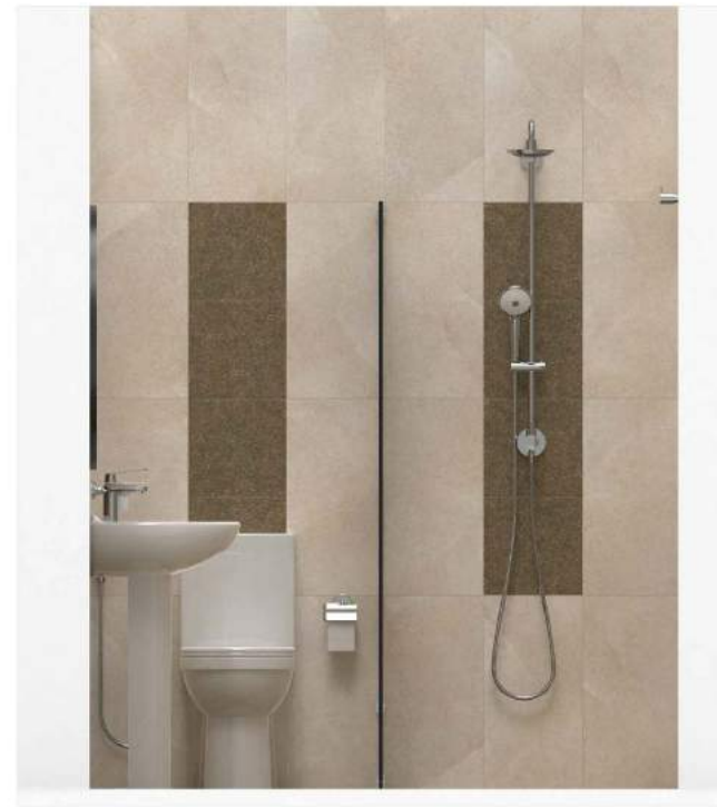
ELEVATION - B