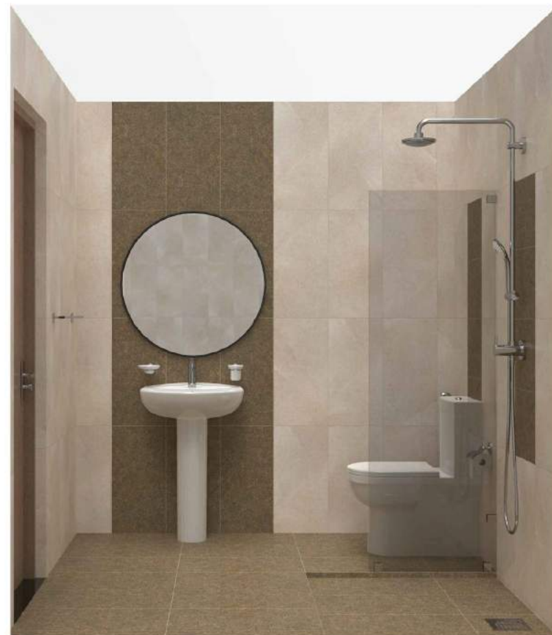
PERSPECTIVE VIEW 01