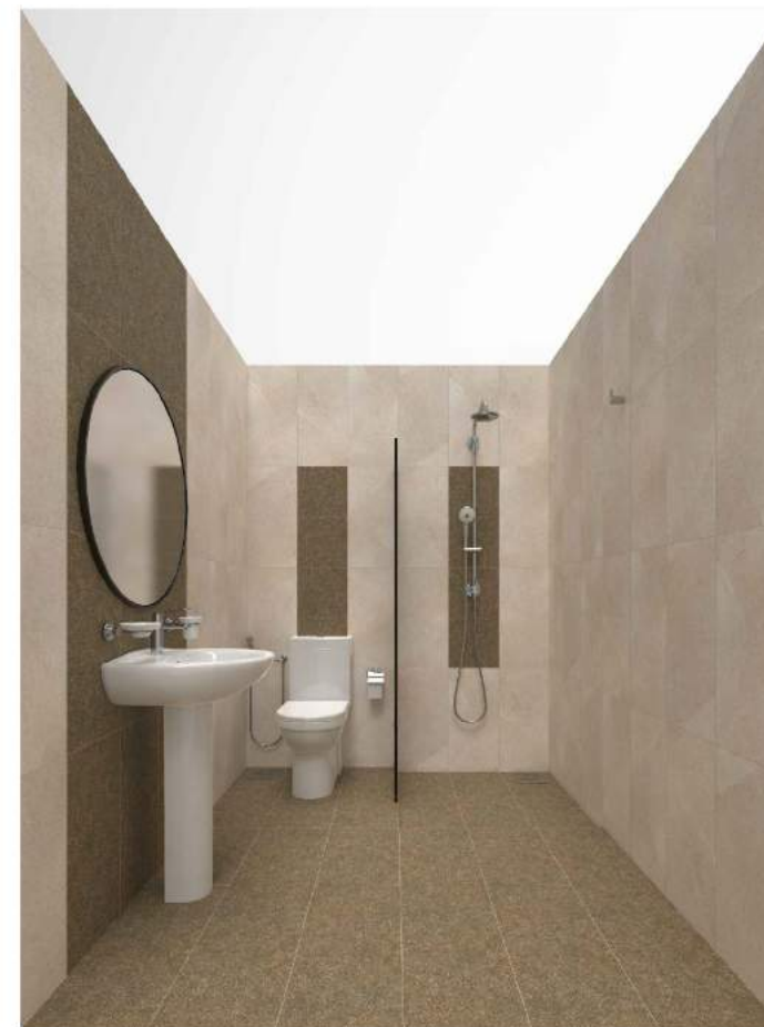
PERSPECTIVE VIEW 02