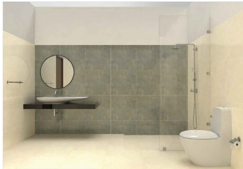
PERSPECTIVE VIEW 01