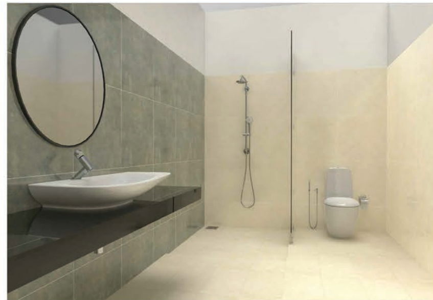
PERSPECTIVE VIEW 02