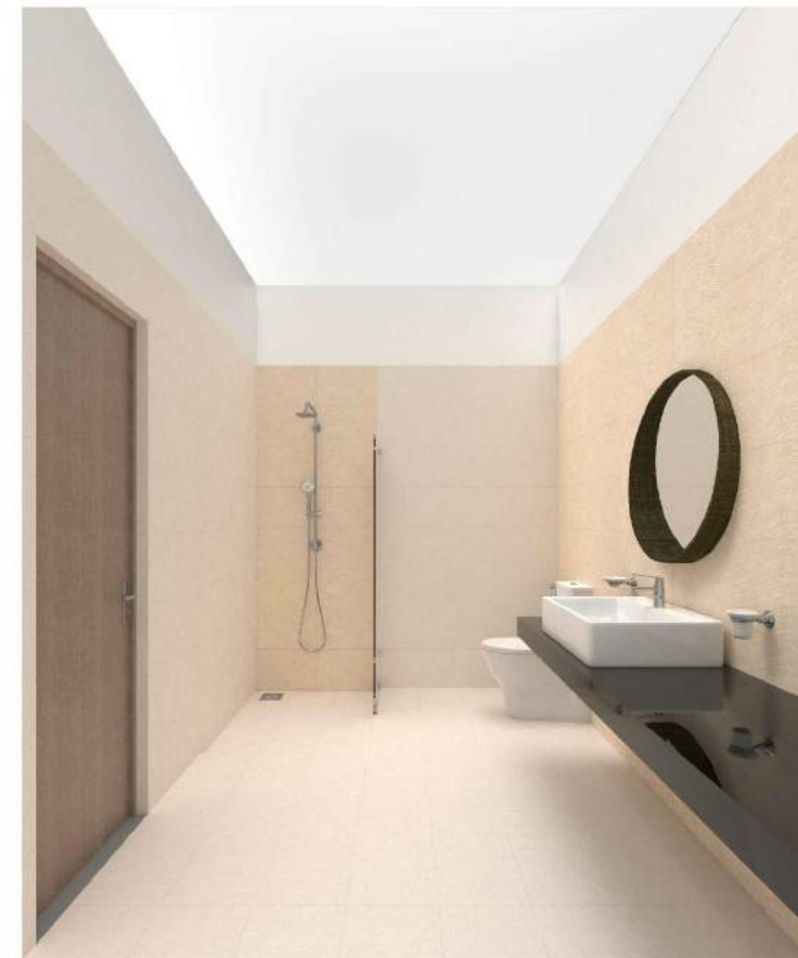
PERSPECTIVE VIEW 02