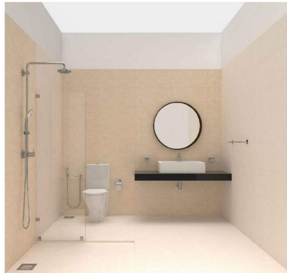
PERSPECTIVE VIEW 01