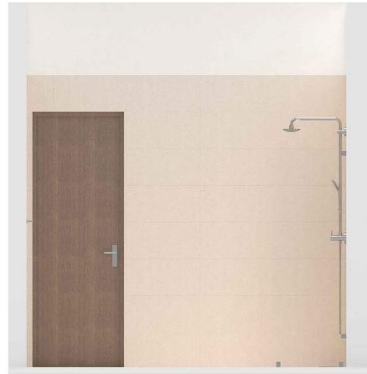
ELEVATION - C