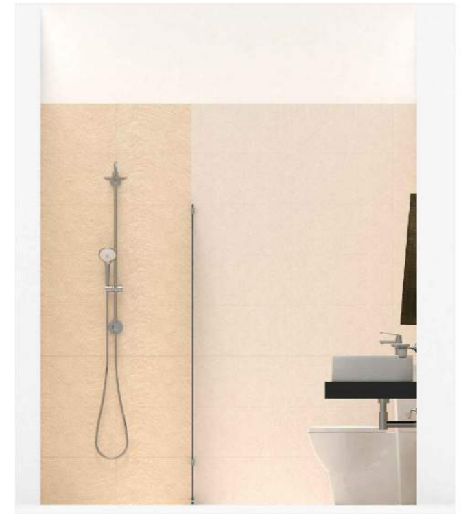
ELEVATION - D