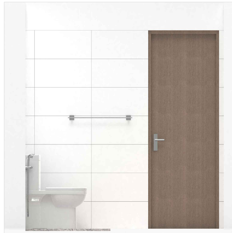
ELEVATION - C