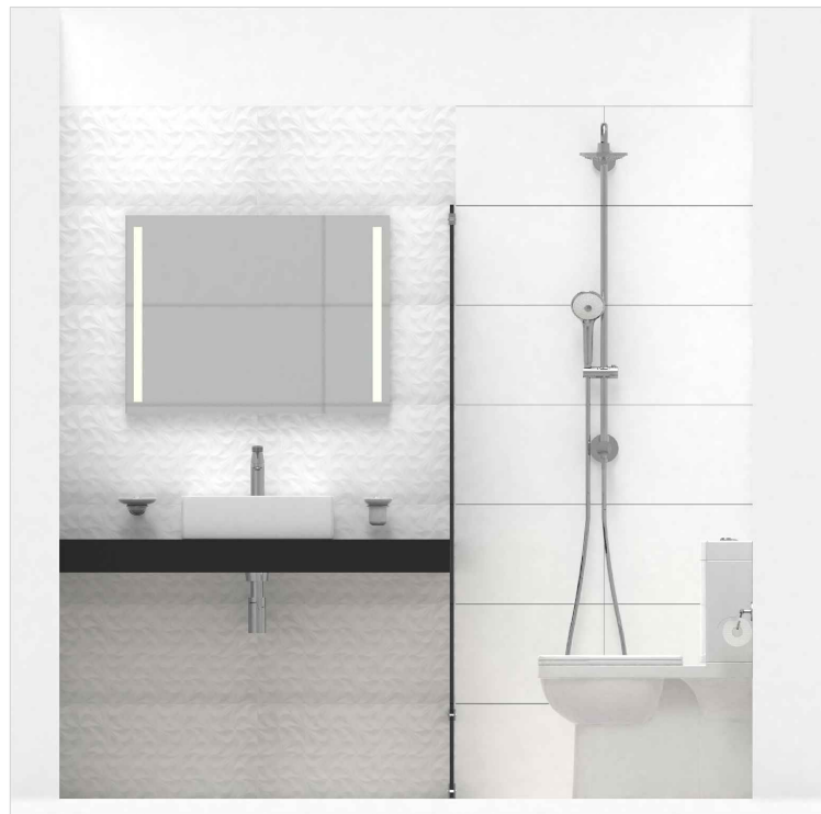
ELEVATION - A