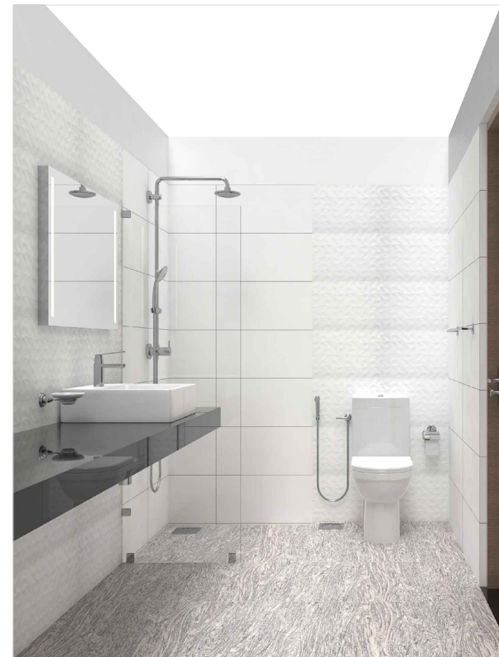
PERSPECTIVE VIEW 02