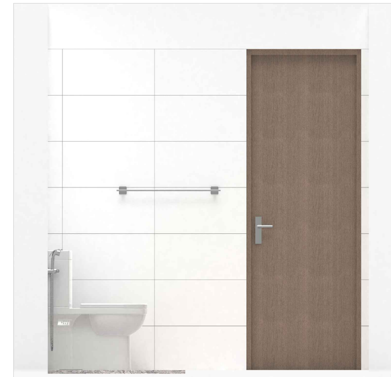
ELEVATION - D