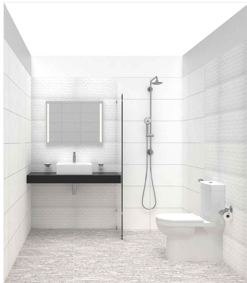
PERSPECTIVE VIEW 01