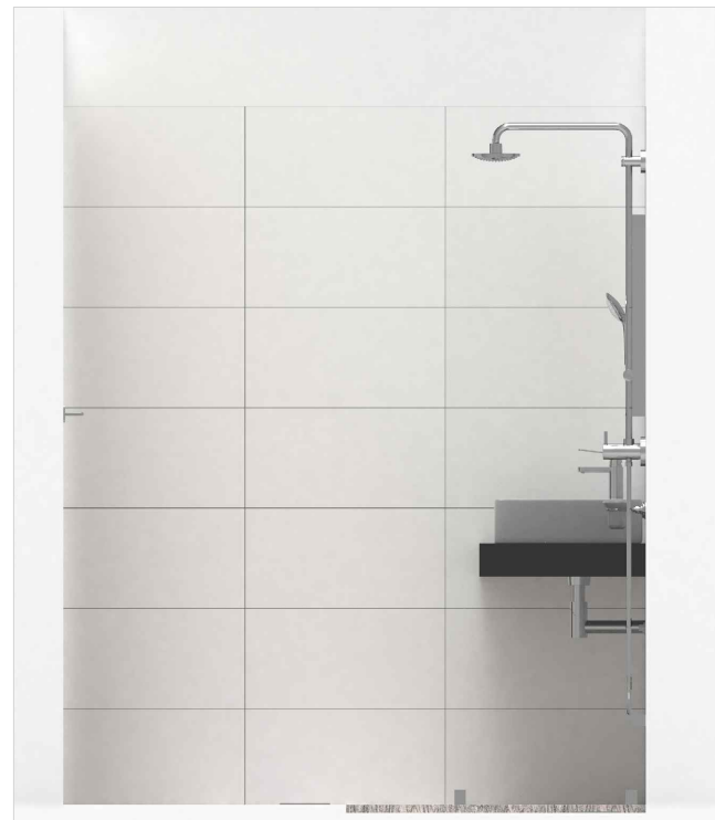
ELEVATION - B