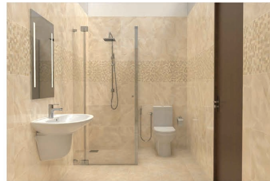
PERSPECTIVE VIEW 02