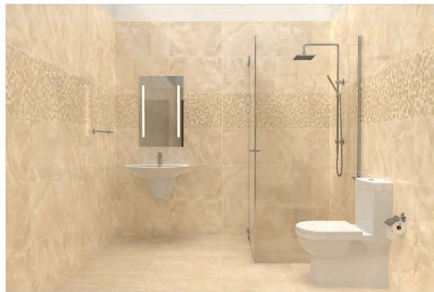
PERSPECTIVE VIEW 01