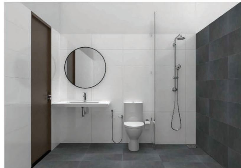
PERSPECTIVE VIEW 01