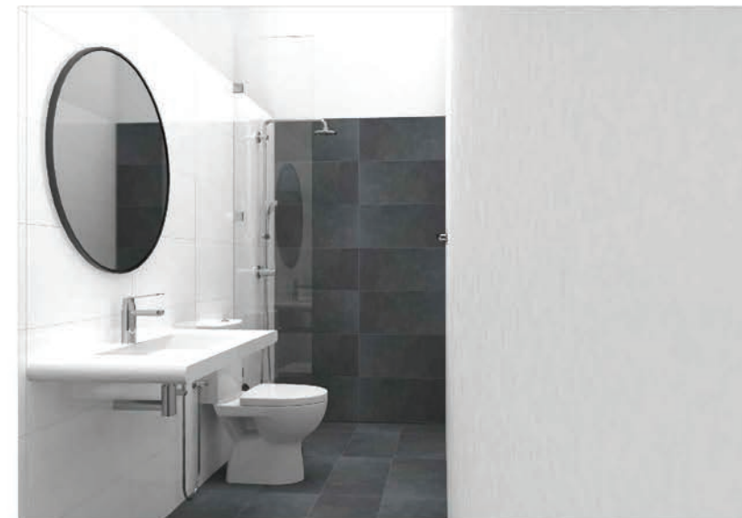
PERSPECTIVE VIEW 02