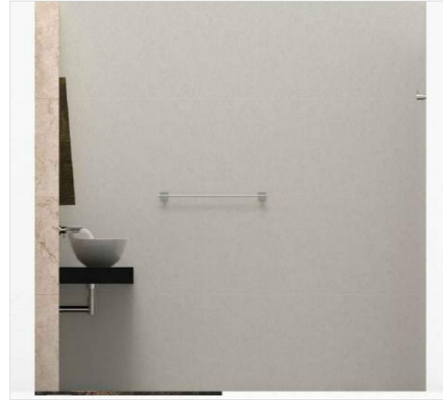
ELEVATION - B