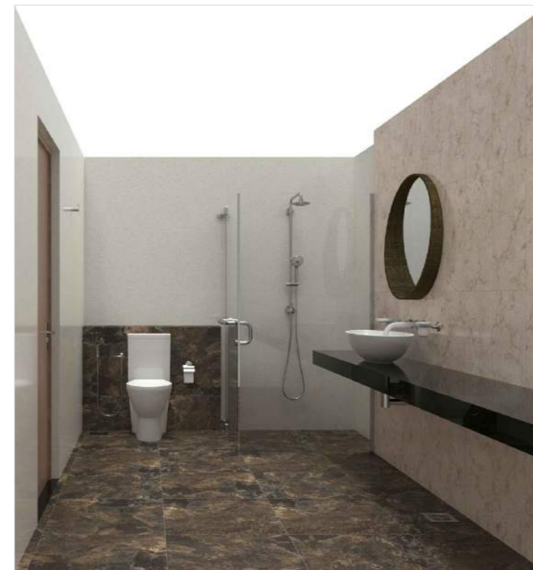
PERSPECTIVE VIEW 02