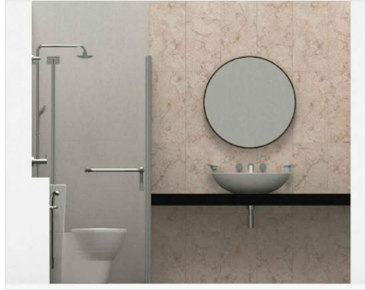
ELEVATION - A