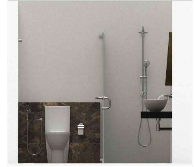
ELEVATION - D