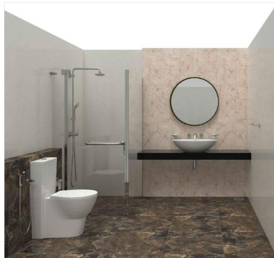
PERSPECTIVE VIEW 01