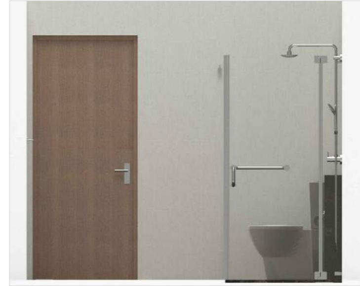
ELEVATION - C