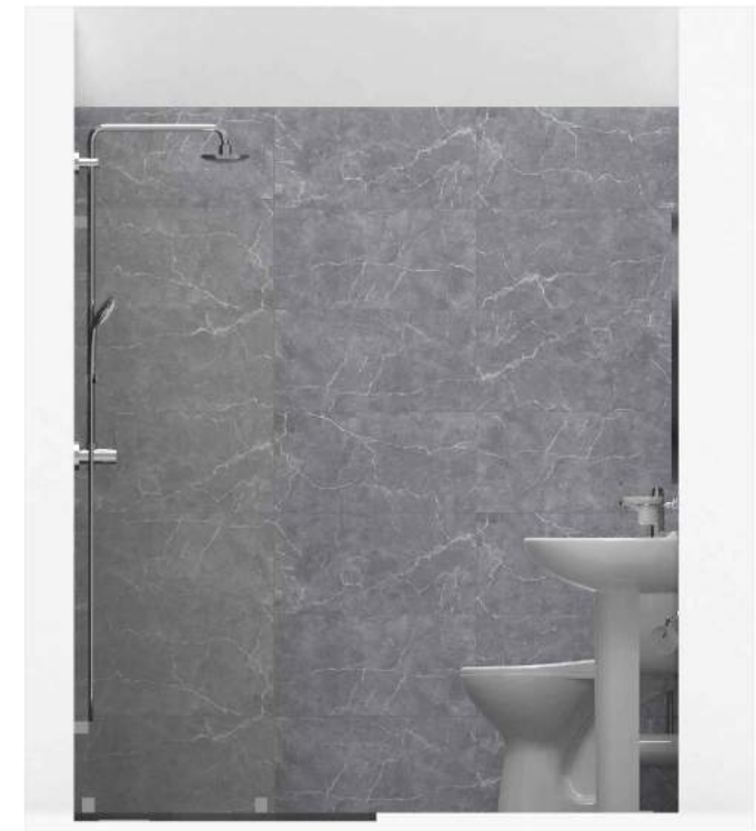
ELEVATION - D