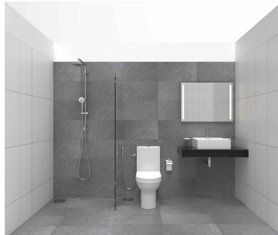
PERSPECTIVE VIEW 01