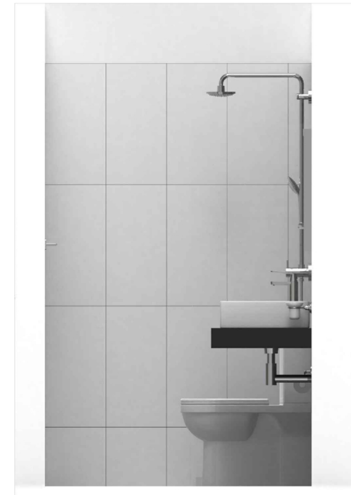
ELEVATION - D