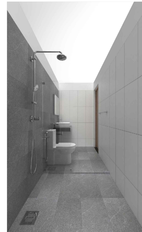
PERSPECTIVE VIEW 02