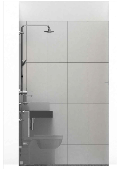
ELEVATION - B