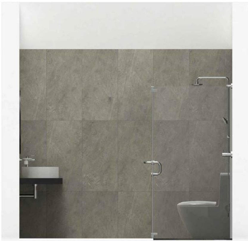
ELEVATION - A