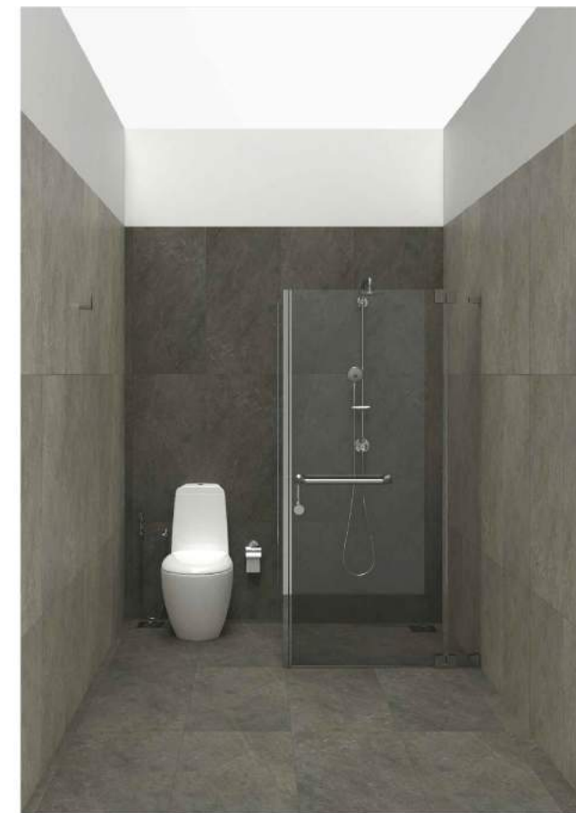
PERSPECTIVE VIEW 02