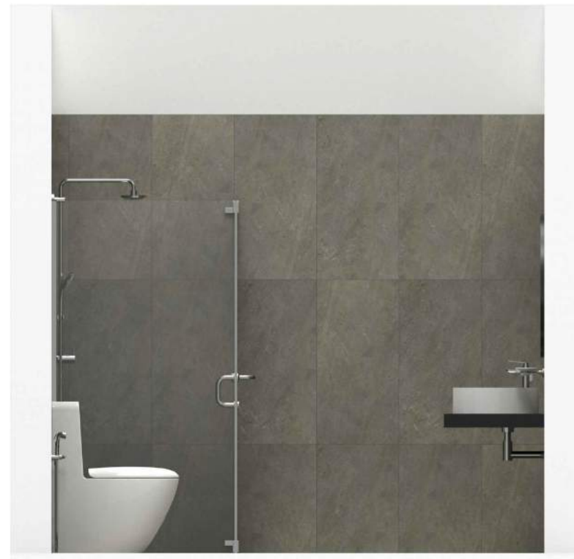
ELEVATION - C