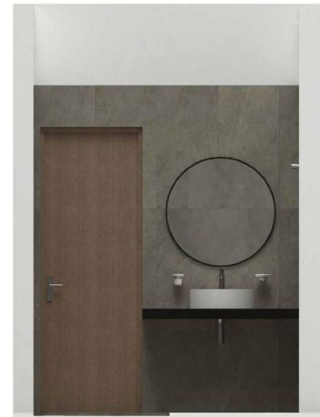
ELEVATION - D