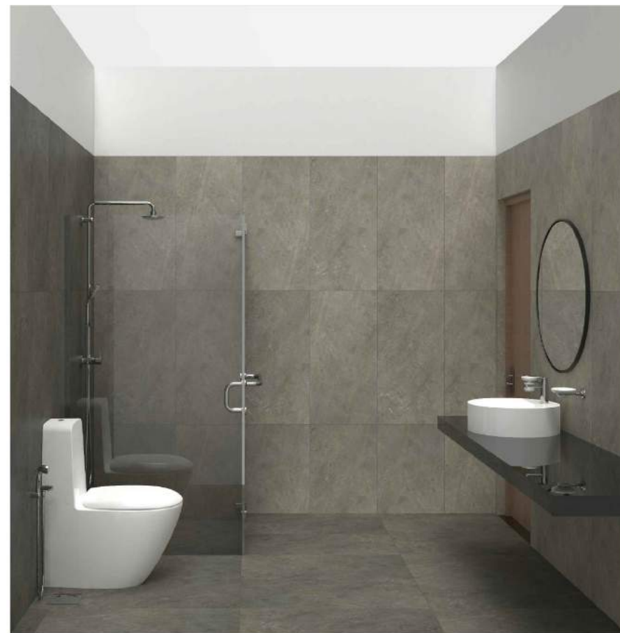
PERSPECTIVE VIEW 01