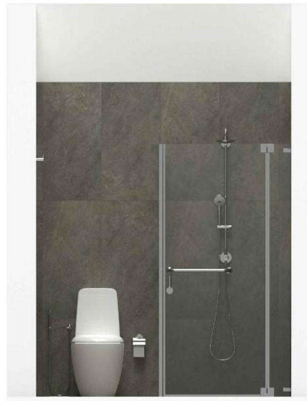
ELEVATION - B