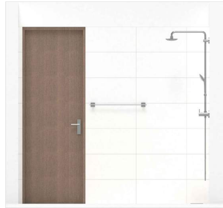
ELEVATION - C