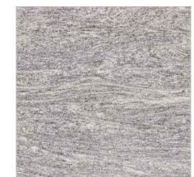
FLOOR TILE GRANITE GRAY [6GM.MA] 60X60CM