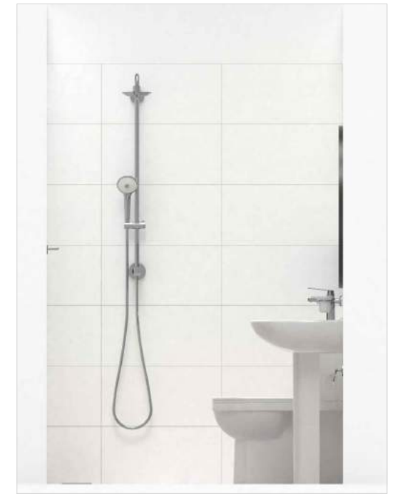
ELEVATION - D