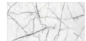
WALL FEATURE TILE 02 MONT BLANC VECTOR [1MW.GL] 60X30CM