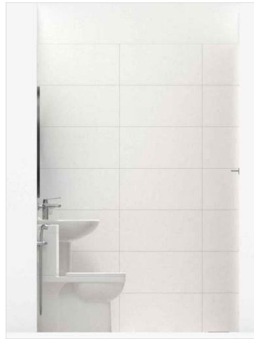
ELEVATION - B