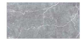
WALL FEATURE TILE 01 NIAGARA GRAY [6DW.GL] 60X30CM