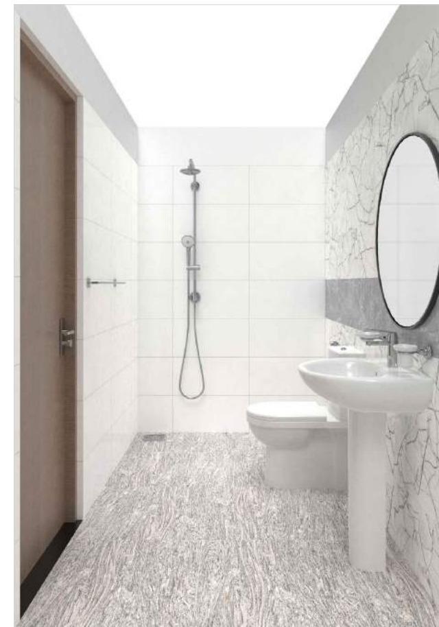
PERSPECTIVE VIEW 02