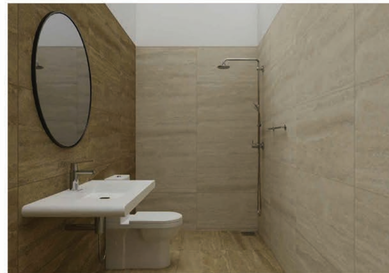
PERSPECTIVE VIEW 01