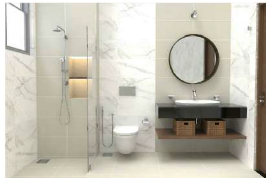
PERSPECTIVE VIEW 01