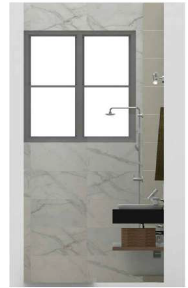
ELEVATION - D