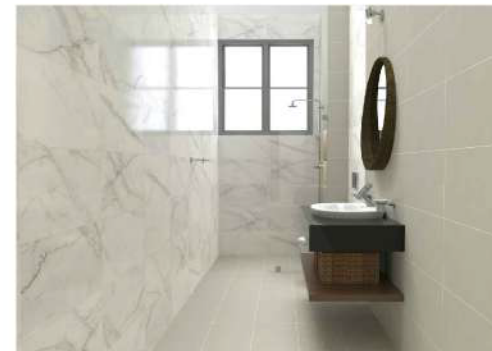
PERSPECTIVE VIEW 02