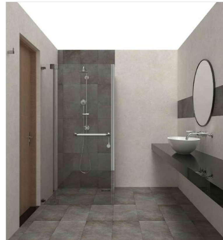
PERSPECTIVE VIEW 02