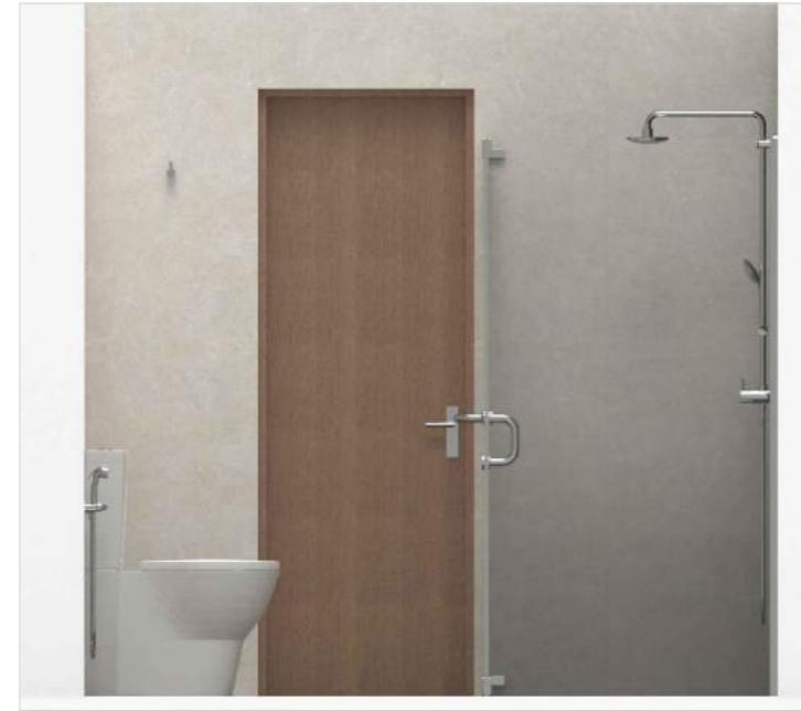
ELEVATION - C