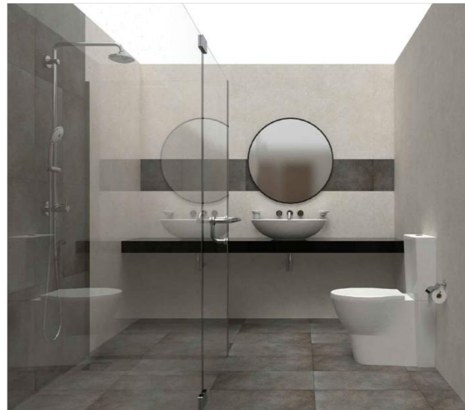
PERSPECTIVE VIEW 01