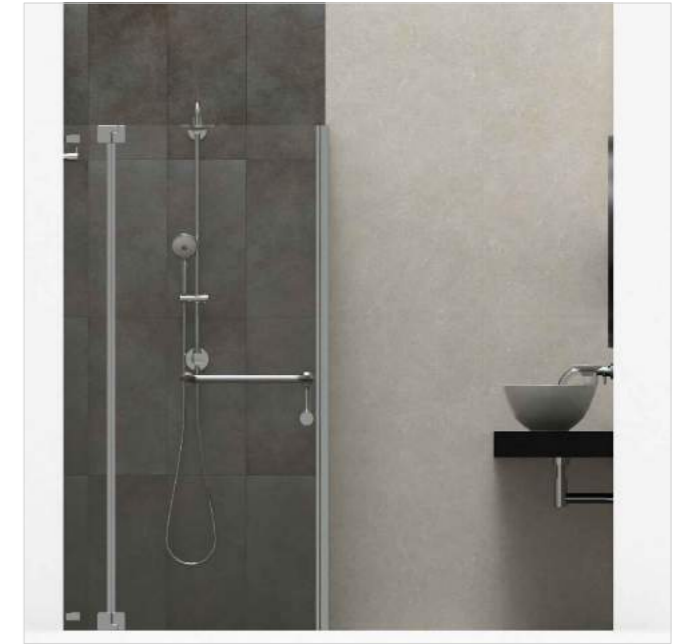
ELEVATION - D