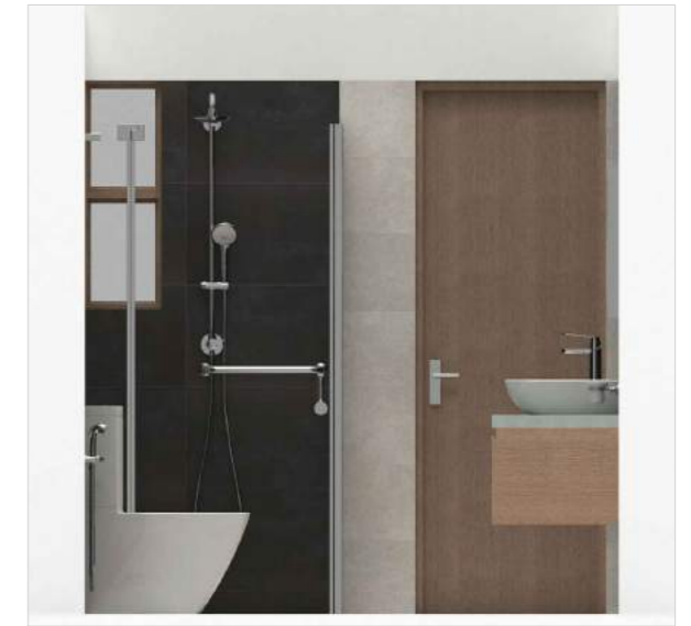
ELEVATION - D