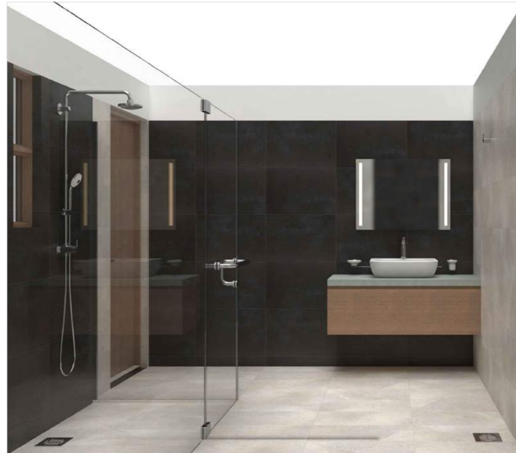
PERSPECTIVE VIEW 01