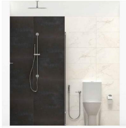
ELEVATION - B