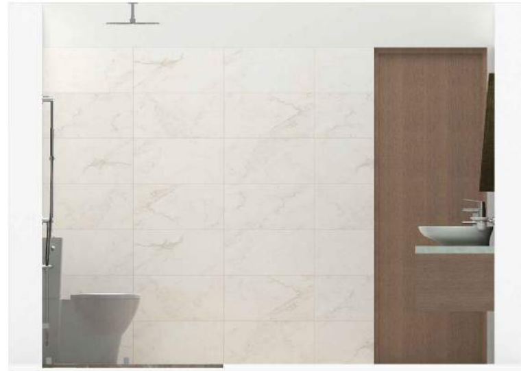
ELEVATION - C