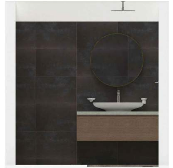
ELEVATION - D