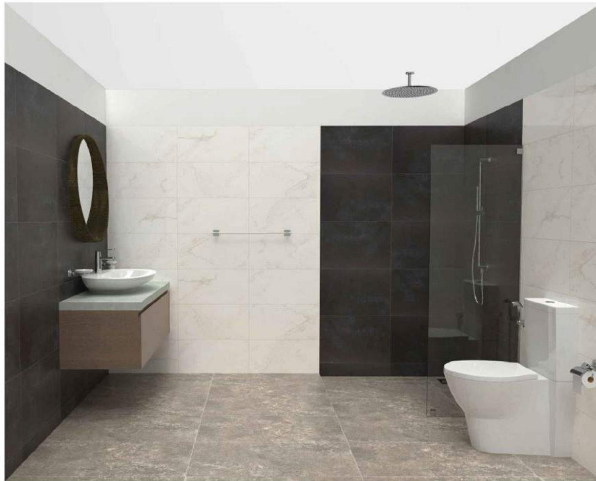
PERSPECTIVE VIEW 01