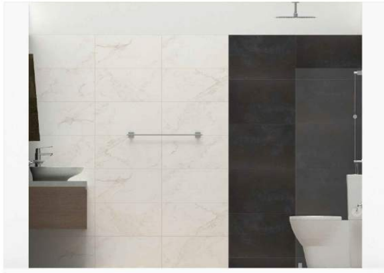
ELEVATION - A